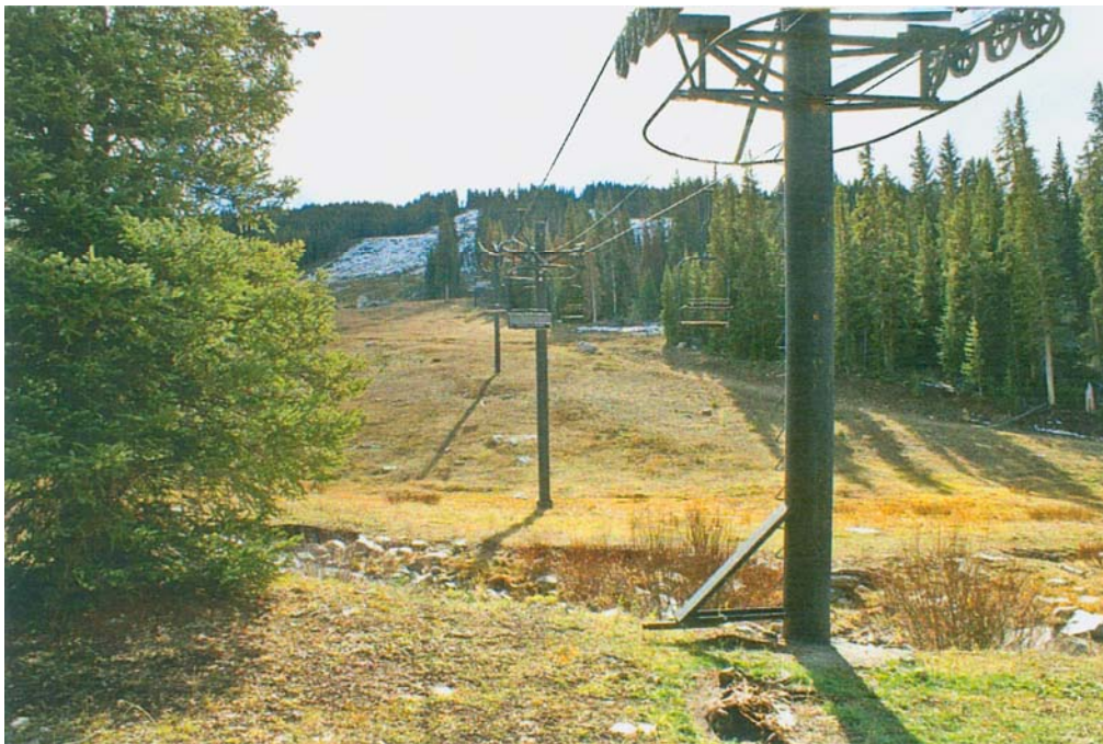
West lift line looking uphill (south) from the base.