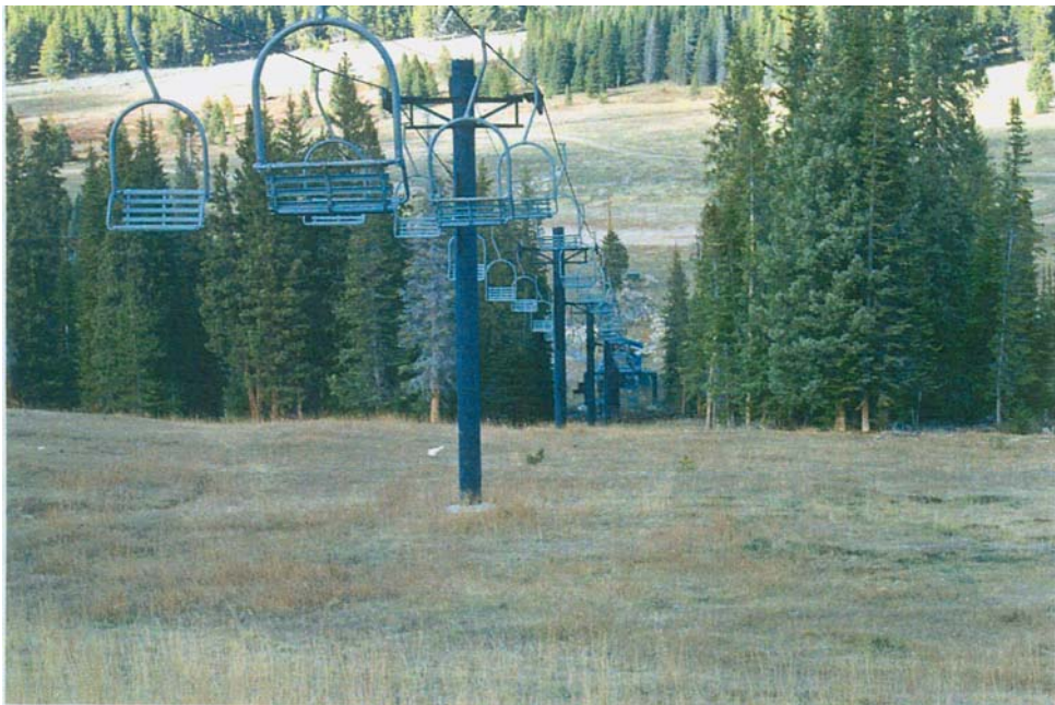
East lift line looking downhill (north) from near the top terminal.