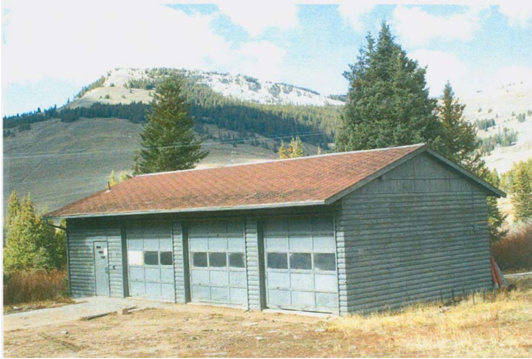
Garage building front and east side looking northwest.