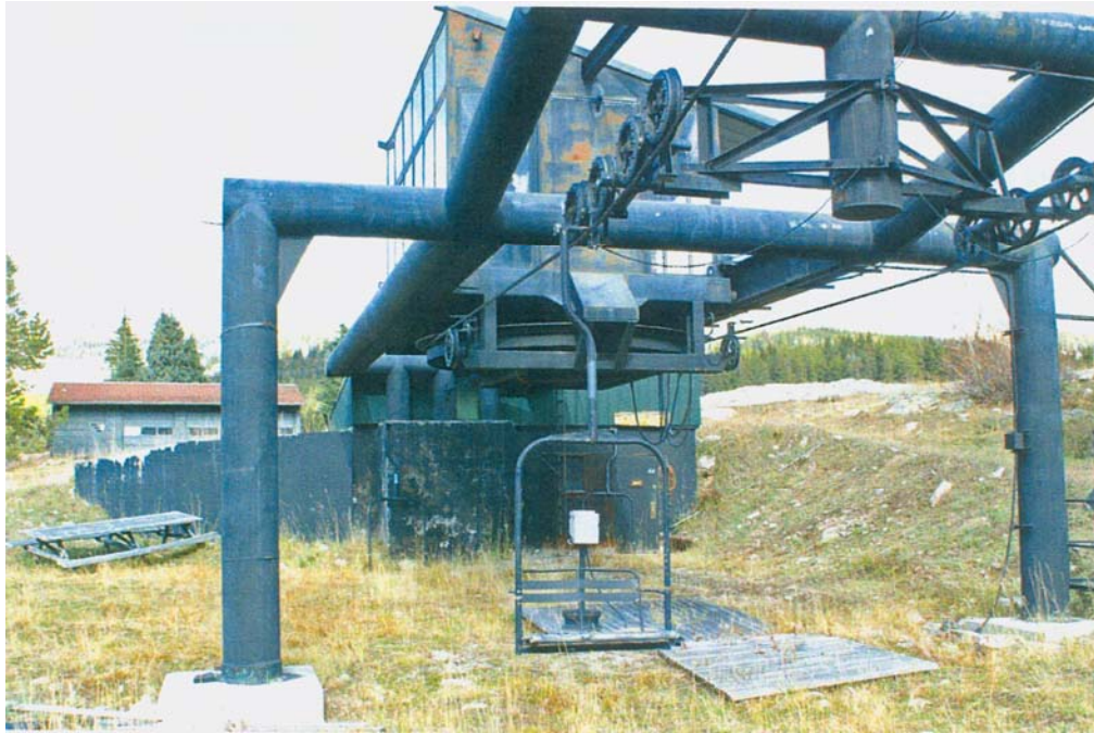
West lift lower terminal looking north.