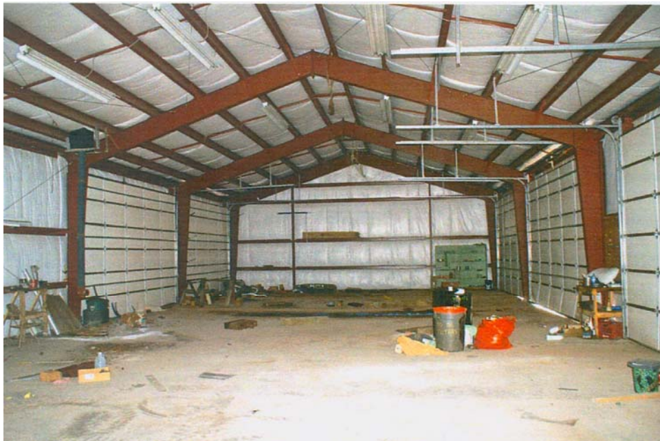
Maintenance building interior.