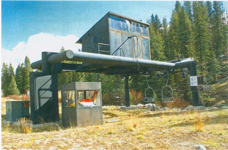
East chairlift bottom terminal looking east.