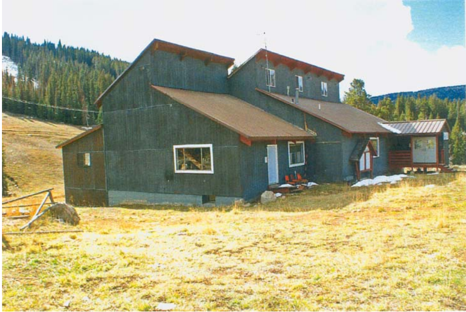
Daylodge looking southwest.