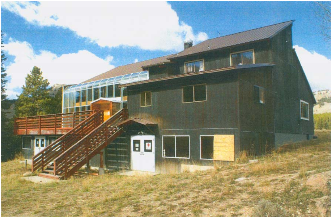
Lodge looking northwest.